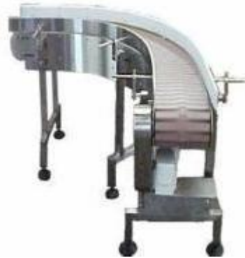
Table Top Chain® Conveyors

Cheetah Systems Table Top Chain Conveyors are built directly to the customers specifications. Straight, curved, inclines, or declines are all manufactured here at our facility in St. Petersburg, Florida.